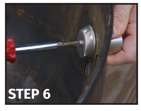
Rotate the Draft Inducer Tube in a clockwise direction until it is secured directly into the damper. If needed, use a screwdriver to ensure it is tight enough.