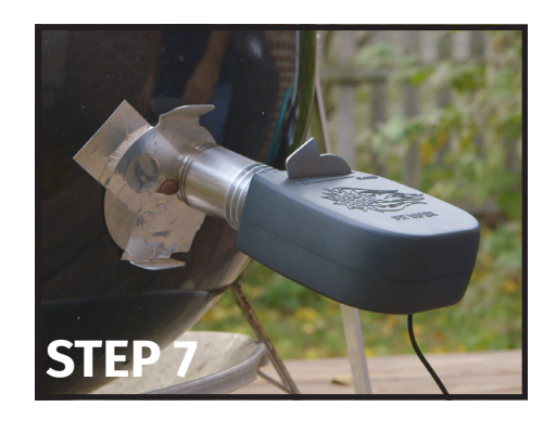
Insert the Pit Viper Fan into the Draft Inducer Tube. You are now ready to cook!