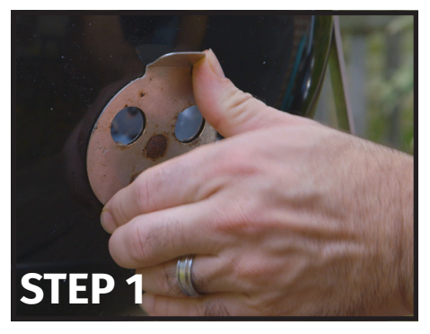
Open one of the dampers on the bottom of the Weber Smokey Mountain. Make sure the other dampers on the bottom are fully closed.