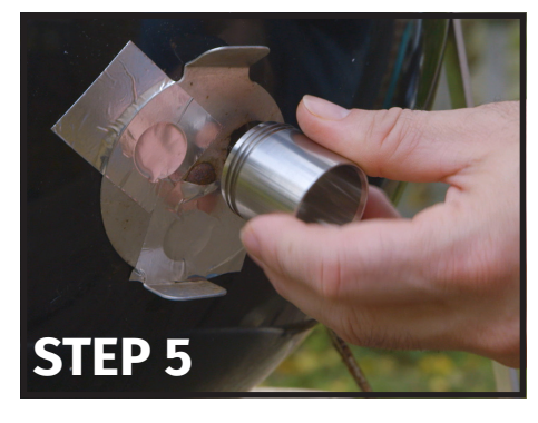
With the threaded end closest to the damper hole, place the Draft Inducer Tube on the outside of the cooker and align it against the damper hole until the screw is inserted into the Draft Inducer Tube.