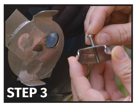
Insert the screw through the hole in the Deflector Plate.