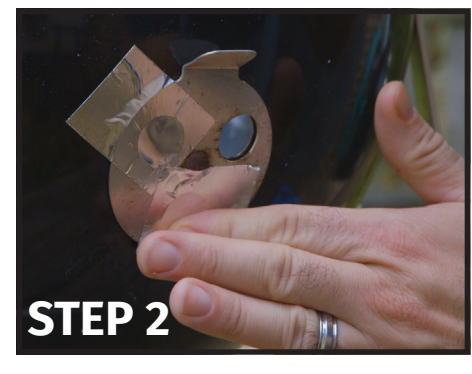
On the damper that you left open, cover all but one hole with the supplied high temperature Foil Tape. Trim if desired.