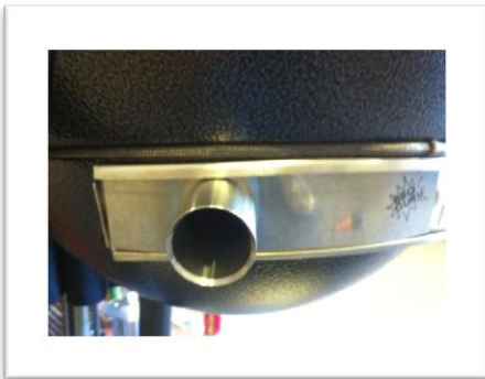
Step 3: Slide adaptor all the way over to the left