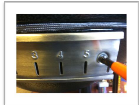
Step 4: Screw damper track back on